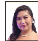
Soci Ame Patagani-Viking Community Service